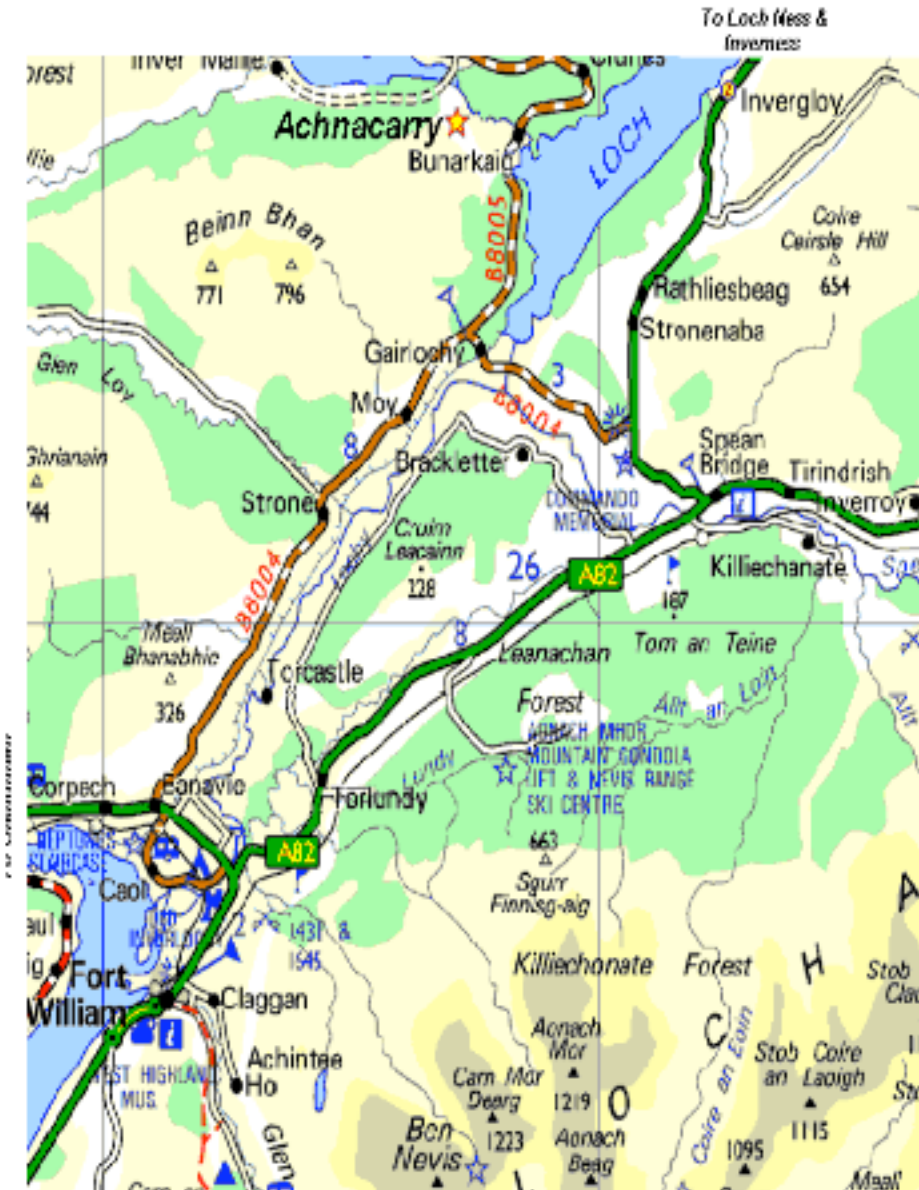
Highlands of Scotland